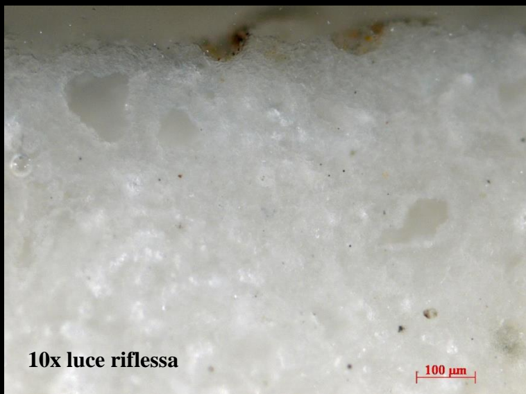
10x luce riflessa