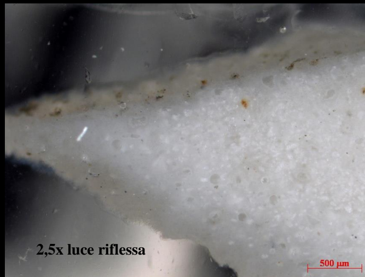
2,5x luce riflessa