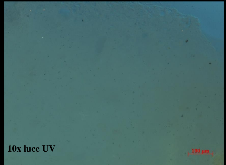
10x luce UV