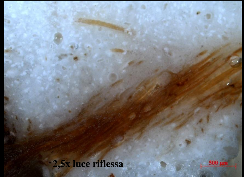
2,5x luce riflessa