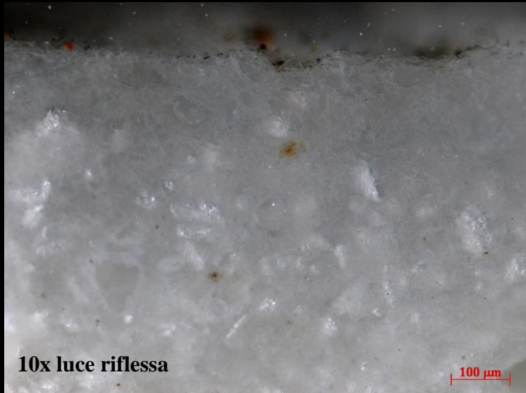
10x luce riflessa