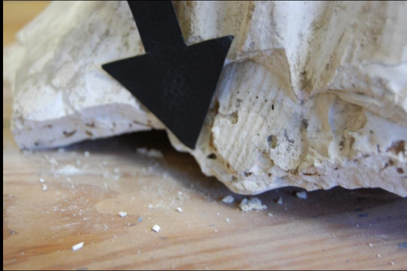
Punto di prelievo