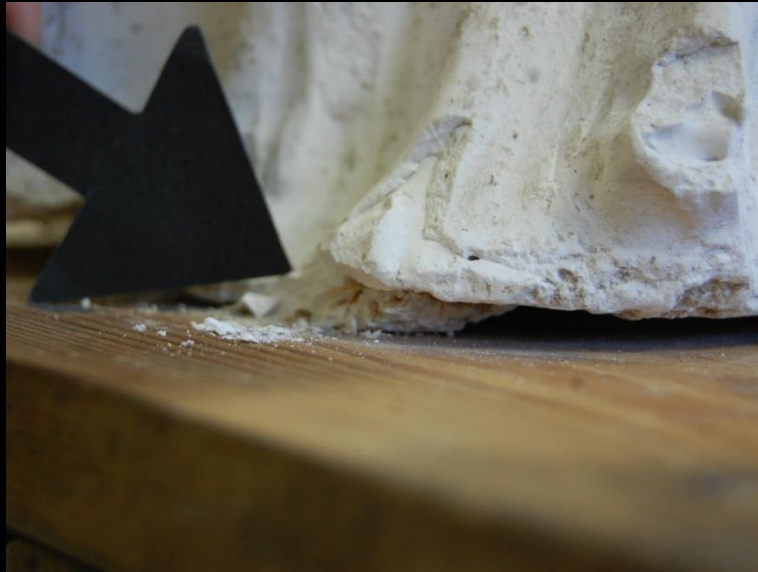
Punto di prelievo