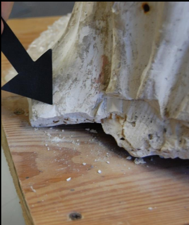
Punto di prelievo