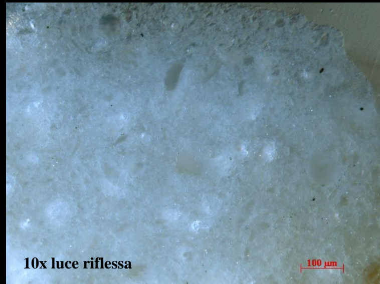
10x luce riflessa