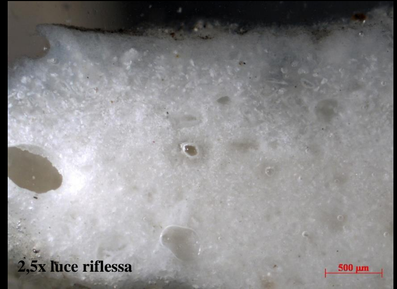
2,5x luce riflessa